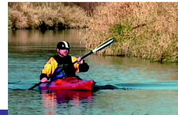
Pioneer Public TV

On the shores of the Beautiful Chippewa River