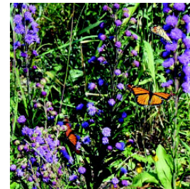
Swift County Monitor News